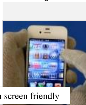
Touch screen friendly

They can be hand washed at 40°, flat dried and smoothed to shape without any loss of medical performance or comfort. The gloves show an extremely low tendency to shed. The gloves are totally pollutant free, scientifically tested and Oeko-tex 100 and CE approved. The medical and security effects described have been proven by many International institutions around the world. The silver fibre is 100% natural and certified. The silver lined gloves and socks are recommended a by a number of health and wellbeing organisations including the Raynaud's & Scleroderma Association of UK and the Autoimmune Resource and Research Centre of NSW Australia.